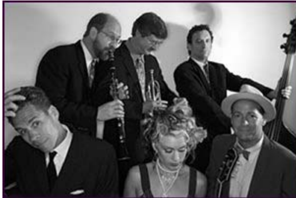
Midnight Serenaders

As much as I often refer to genre names, it is easy to get too bogged down in labels. This emphasis on genre can hinder or prevent one's enjoyment and exploration of all the music which is out there to discover. I recently had the pleasure of discovering the music of a sextet out of Portland, Oregon, called The Midnight Serenaders. Are they hot jazz, country swing? It does not matter; they incorporate many early jazz elements. Their album Magnolia is a pleasure to listen to. It manages to be both fun and art.